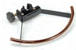
Patient Handle (PEDP3303)