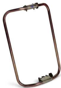
Infusion Pump Hoop (PEDP1083F)