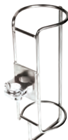
Oxygen Tank Holder (MDS806000TH)