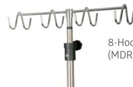
8-Hook Rake Top (MDR80600R)